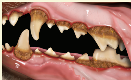
Early signs of gum disease