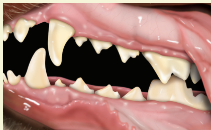
Healthy teeth and gums